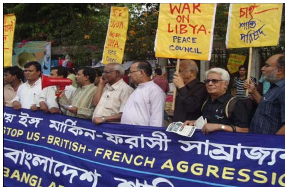
Bangladesh Peace Council demonstration against US-NATO aggression in Libya

13. The conference expresses its solidarity with the people of Nepal and hope that it will carry forward the peace